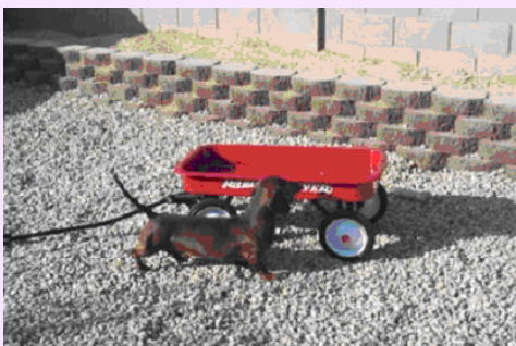
Look at that topline!