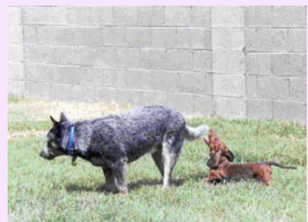
Who's herding WHOM?